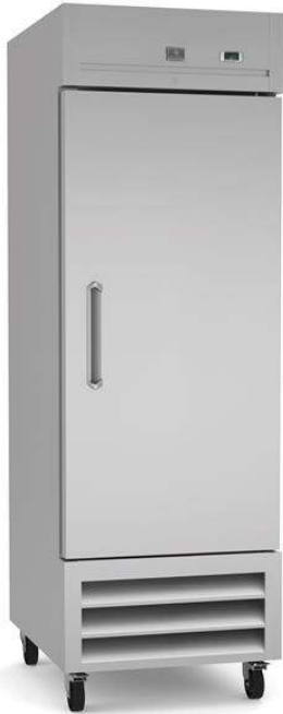
738241 (KCHRI27R1DRE) 1-Door Full Height Refrigerator 27" Long